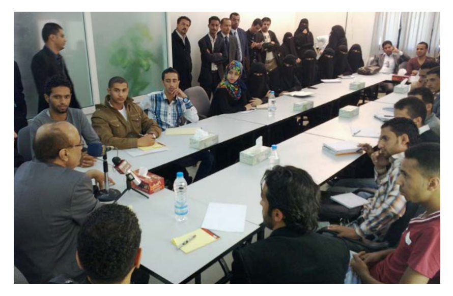
Students taking a course at the MBI Al Jaber Media Institute

Following the events of 2011 and the revolution in Yemen, all forms of media have seen a period of rapid development. Drawing on previous projects in the fields of journalism and media, Sheikh Mohamed proposed the establishment of an independent, privately funded institution to train journalists, students, teachers and trainers and citizens in all aspects of media.